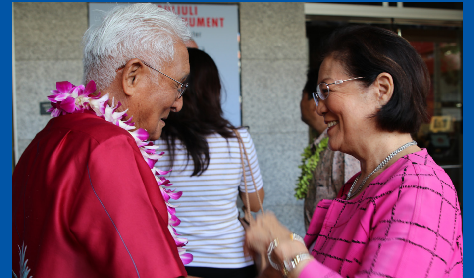
Senator Hirono meets with seniors at the Japanese Cultural Center of Hawaii in Honolulu.

I'm fighting every day to lower costs for families in Hawaii. The Inflation Reduction Act will tackle inflation by lowering energy and health care costs, as well as combating climate change — without raising taxes on working families.